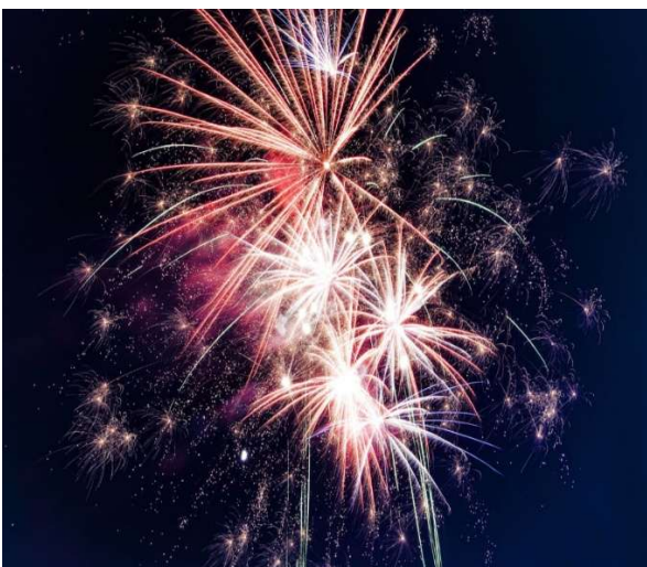
Bible Camp Fireworks on July 4 th !